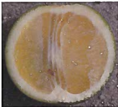
Lopsided bitter, hard fruit with small dark aborted seeds