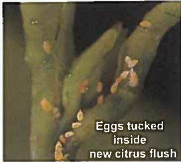
Eggs tucked inside new citrus flush