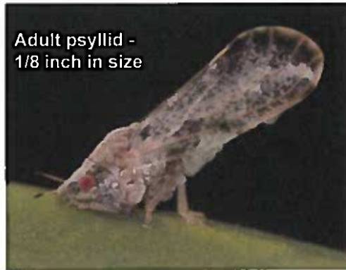
Adult psyllid - 1/8 inch in size