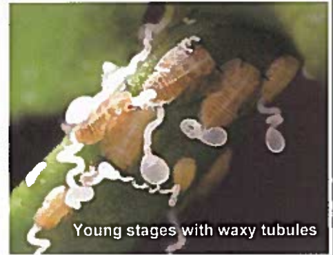
Young stages with waxy tubules