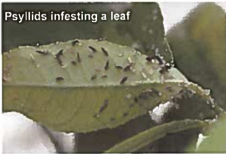
Psyllids infesting a leaf